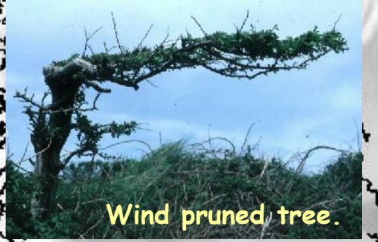
Wind pruned tree.