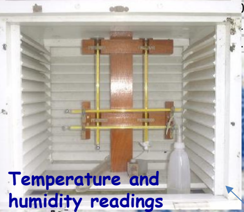
Temperature and humidity readings